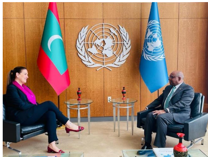
President of the General Assembly His Excellency Abdulla Shahid met with the Minister of Tourism & Environment of the Republic of Albania Her Excellency Mirela Kumbaro. Discussed issues pertaining to sustainable tourism, climate change & women's empowerment.