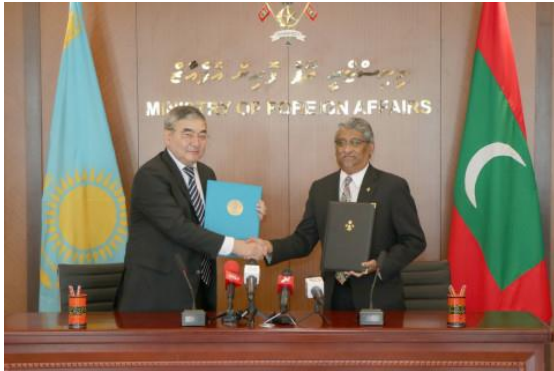
Minister of State for Foreign Affairs His Excellency Ahmed Khaleel and Ambassador of Kazakhstan to the Maldives His Excellency Nurlan Zhalgasbayev during the signing of the Visa Waiver Agreement.

Speaking at the ceremony, State Minister Khaleel thanked the Government of Kazakhstan for their commitment to further strengthen the bilateral relationship between the two countries, and mentioned that the signing of this agreement is an important milestone that will facilitate stronger people to people contact, and increase business and investment opportunities for both the Maldives and Kazakhstan.