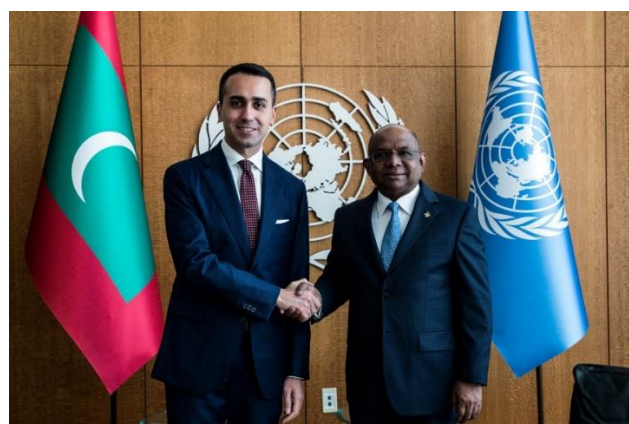
President of the General Assembly His Excellency Abdulla Shahid met with the Foreign Minister of Italy His Excellency Luigi Di Maio. Discussed the crisis in Ukraine, Food security and UNSC reform