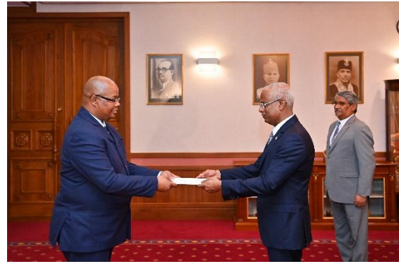
The new non-Resident High Commissioner of the Republic of South Africa to the Maldives presented his credentials to His Excellency President Ibrahim Mohamed Solih.