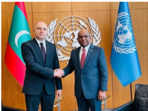
President of the General Assembly His Excellency Abdulla Shahid met with the Culture Minister of Azerbaijan His Excellency Mr. Anar Karimov and Was briefed on the "Peace4Culture Global Call" initiative which emphasizes intercultural & interreligious dialogue & the interdependence of peaceful relations & the safeguarding of cultural & religious heritage.