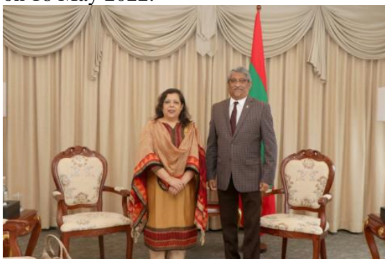
Minister of State for Foreign Affairs His Excellency Ahmed Khaleel and Secretary, Ministry of Environment, Forest and Climate Change of India, Leena Nandan.

Secretary, Ministry of Environment, Forest and Climate Change of India, Leena Nandan paid a courtesy call on Minister of State for Foreign Affairs, Ahmed Khaleel on 18 May 2022.