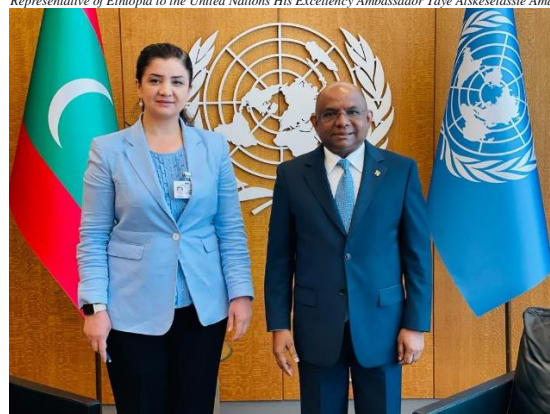
President of the General Assembly His Excellency Abdulla Shahid met with the Minister of Labour, Immigration & Employment of Tajikistan, Her Excellency Ms. Shirin Amonzoda.