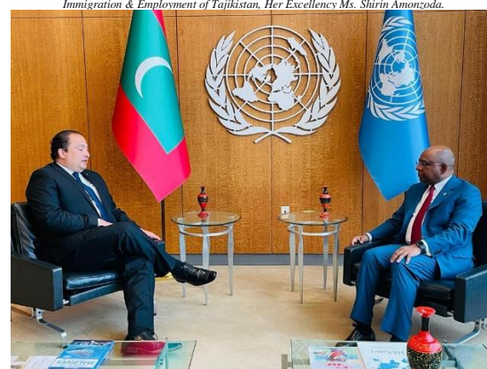
President of the General Assembly His Excellency Abdulla Shahid met with the Minister of Foreign Affairs of Guatemala His Excellency Mr. Mario Adolfo Bócaro Flores. Reflected on the need enhance global cooperation on the issue of migration.