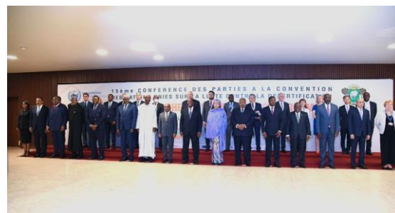
President of the UN General Assembly His Excellency Abdulla Shahid attending the 15 th Session of the Conference of the Parties to the United Nations Convention to Combat Desertification

The President of the UN General Assembly, His Excellency Abdulla Shahid, undertook an official visit to Côte d'Ivoire from 9-11 May 2022. This is ahead of the 15 th Session of the Conference of the Parties to the United Nations Convention to Combat Desertification.