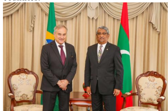
Minister of State for Foreign Affairs His Excellency Ahmed Khaleel and the new Ambassador of Brazil to the Maldives Sergio Luiz Canaes

The new Ambassador of Brazil to the Maldives Sergio Luiz Canaes called on the Minister of State for Foreign Affairs Ahmed Khaleel, on 9 May 2022. During the meeting held at the Ministry of Foreign Affairs, State Minister Khaleel congratulated Ambassador Canaes on his appointment and discussed avenues for strengthening relations between the two countries.