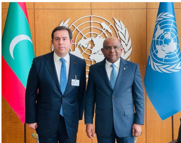
President of the General Assembly His Excellency Abdulla Shahid met with the Migration and Asylum Minister of Greece His Excellency Panagiotis Mitarachi. Discussed how the challenge of migration will accelerate in the coming years.