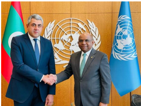
President of the General Assembly His Excellency Abdulla Shahid met with the Secretary General of the World Tourism Organization His Excellency Mr. Zurab Pololikashvili and commended the WTO's close cooperation with WHO to minimize the impact on travel due to Covid-19.