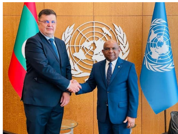
President of the General Assembly His Excellency Abdulla Shahid met with the Chairman of the Council of Ministers of Bosnia & Herzegovina, His Excellency Dr. Zoran Tegeltija.