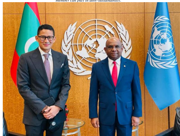
President of the General Assembly His Excellency Abdulla Shahid met with the Tourism & Creative Economy Minister of Indonesia His Excellency Mr. Sandiaga Salahuddin Uno.