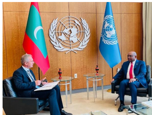
President of the General Assembly His Excellency Abdulla Shahid met with Hungarian Candidate for the President of the 77 th session of the UN General Assembly His Excellency Mr. Csaba Kőrösi.