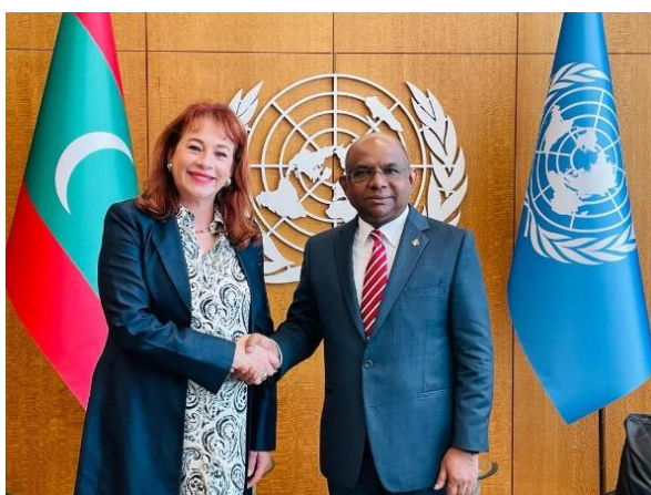
President of the General Assembly His Excellency Abdulla Shahid met with the 73 rd President of the General Assembly Her Excellency Ms. María Fernanda Espinosa. to share notes on the respective Presidencies, priorities & challenges.