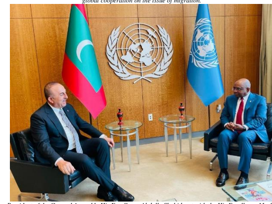
President of the General Assembly His Excellency Abdulla Shahid met with the His Excellency Mevlüt Çavuşoğlu, Minister of Foreign Affairs of Türkiye. Discussions primarily touched on issues relating to migration