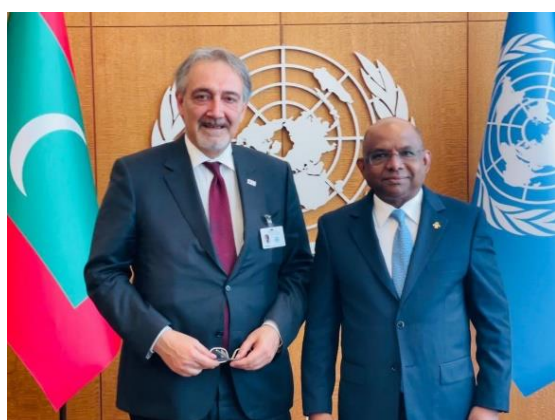
President of the General Assembly His Excellency Abdulla Shahid met with the President of the International Federation of Red Cross and Red Crescent Societies Mr. Francesco Rocca. Was briefed on the role of local actors who are crucial to saving lives & in preparing communities in humanitarian situations