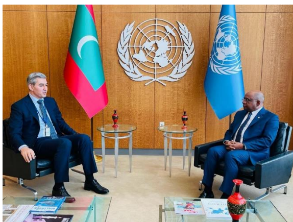
President of the General Assembly His Excellency Abdulla Shahid met with the Chief of State Migration Service of the Republic of Azerbaijan. Discussed a range of issues including on migration.