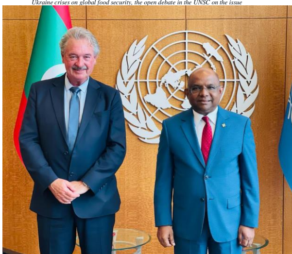
President of the General Assembly His Excellency Abdulla Shahid met with the Foreign Minister of Luxembourg, His Excellency Mr. Jean Asselborn.