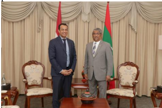
Minister of State for Foreign Affairs His Excellency Ahmed Khaleel and Newly appointed Non-Resident Ambassador of Egypt to Maldives His Excellency Maged Mosleh Nafei.

The newly appointed Non-Resident Ambassador of the Arab Republic of Egypt to the Republic of Maldives, His Excellency Maged Mosleh Nafei paid a courtesy call on the Minister of State for Foreign Affairs, His Excellency Ahmed Khaleel, on 17 May 2022 following the ceremony held at the President's Office to present his Credentials to the President.