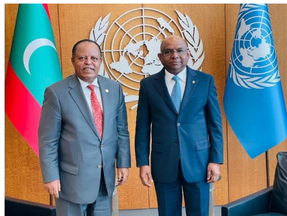
President of the General Assembly His Excellency Abdulla Shahid met with the Permanent Representative of Ethiopia to the United Nations His Excellency Ambassador Taye Atskeleslassie Amde.