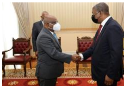
President of the UN General Assembly His Excellency Abdulla Shahid called on the President of Angola His Excellency João Lourenço.

During the visit the President of the General Assembly had called on President of Angola His Excellency João Lourenço and commended Angola’s Commitment to multilateralism, Contribution to the work of the United Nations and the efforts to fight severe drought through the Cunene water transfer system.