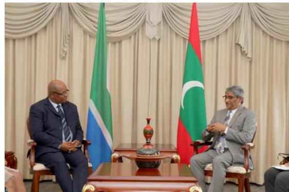
Minister of State for Foreign Affairs His Excellency Ahmed Khaleel and Newly appointed Non-Resident High Commissioner of South Africa to the Republic of Maldives, His Excellency Sandile Edwin Schalk.

At the meeting held at the Ministry of Foreign Affairs, State Minister Khaleel welcomed High Commissioner Schalk and congratulated him on presenting credentials as the Non-Resident High Commissioner from South Africa to Maldives. Underscoring the long-standing bonds of friendship between the Maldives and South Africa, State Minister Khaleel and Ambassador Schalk exchanged views on further consolidating bilateral ties and intensifying collaboration and exchanges between the two countries.