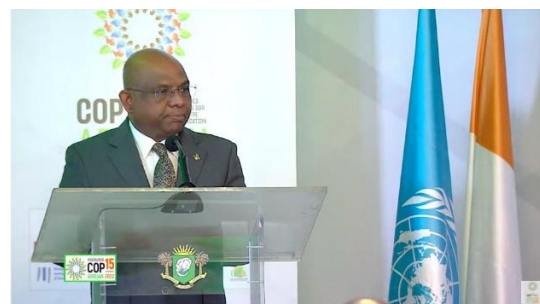
President of the UN General Assembly His Excellency Abdulla Shahid delivering his remarks at the 15 th Session of the Conference of the Parties to the United Nations Convention to Combat Desertification

The agenda for the conference include the restoration of one billion hectares of degraded land between now and 2030 and future-proofing people, their homes and lands against the impacts of disaster risks linked to climate change, such as droughts, and sand and dust storms. The conference is also expected to agree on policy actions to provide an enabling environment for land restoration through stronger tenure rights, gender equality, land use planning and youth engagement to draw private sector investment to conservation, farming, and land uses and practices to improve the health of the land.