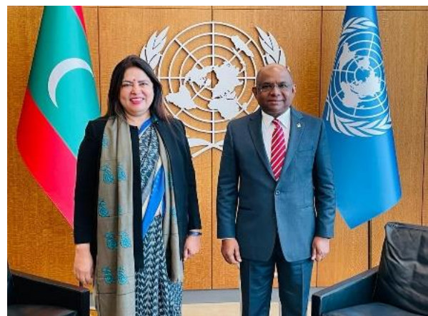
President of the General Assembly His Excellency Abdulla Shahid met with India's Minister of State for External Affairs and Culture Her Excellency Ms. Meenakshi Lekhi. Discussed the ongoing conflict in Ukraine on the global commodity, financial and energy markets across the world.

President of the General Assembly's regular meetings with Heads of Government, Foreign Ministers, the Permanent Representatives, and Heads of International Organisations continued in May.