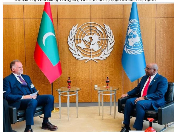
President of the General Assembly His Excellency Abdulla Shahid met with the Minister of Tourism of Italy His Excellency Mr. Massimo Garavaglia. Exchanged views on the importance and urgency of a sustainable tourism recovery to kickstart the global economy and the crucial role that Italy, as a G20 member can play in debt-sustainability.