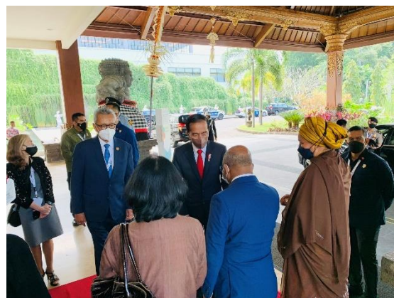
President of the General Assembly received the President of the Republic of Indonesia His Excellency President Joko Widodo for the Global platform for United Nations Office for Disaster Risk Reduction 2022.

Office for Disaster Risk Reduction the President stated that "We must recommit to the principles of the Sendai Framework & dramatically increase our investments in disaster risk reduction, particularly prevention and preparedness." Additionally, President of the General Assembly highlighted the importance of risk reduction and the need for it to be embedded in everyone's lives.