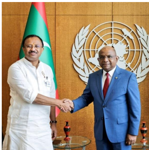
President of the General Assembly His Excellency Abdulla Shahid met with the Minister of State for External Affairs for India, His Excellency Mr. V. Muraleedharan. Discussed the ongoing impact of the Ukraine crises on global food security, the open debate in the UNSC on the issue