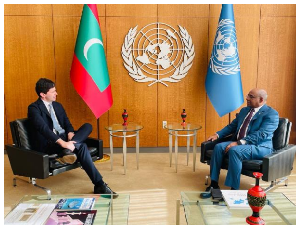
President of the General Assembly His Excellency Abdulla Shahid met with the Minister of Health of Italy His Excellency Mr. Roberto Speranza. Discussions touched on pandemic preparedness, global health governance issues, vaccine equity & the importance of multilateralism for addressing current & emerging global challenges