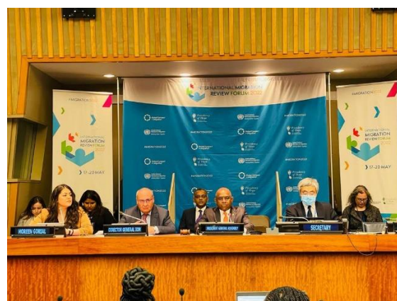
President of the UN General Assembly His Excellency Abdulla Shahid presiding over the one-day informal interactive multi-stakeholder hearing.

Furthermore, the President of the General Assembly Abdulla Shahid organized and presided over a one-day informal interactive multi-stakeholder hearing on 16 May 2022. This hearing provided a significant opportunity for all relevant stakeholders to engage actively in the implementation, follow-up and review of the Global Compact for Safe, Orderly and Regular Migration, building on the regional reviews.