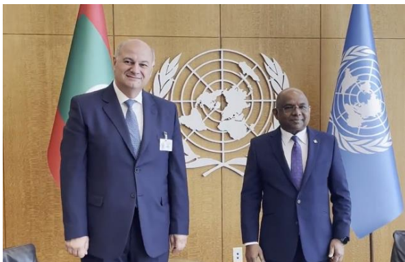
President of the General Assembly His Excellency Abdulla Shahid met with Minister of Justice of Greece Mr. Konstantinos Tsiras. Discussed issues such as Climate change and youth empowerment