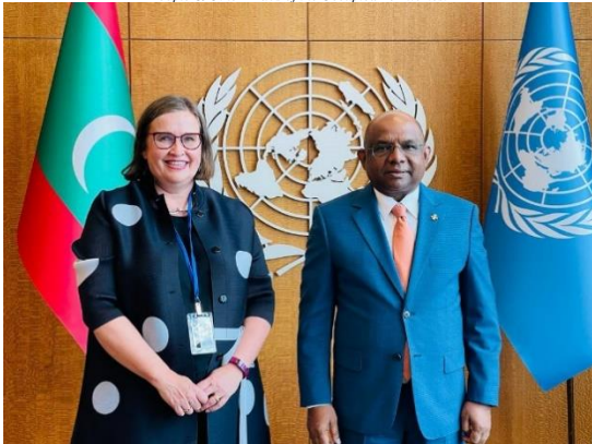
President of the General Assembly His Excellency Abdulla Shahid met with Sex Discrimination Commissioner of Australia Ms. Kate Jenkins. Discussed issues pertaining to women's empowerment including combatting violence against women, mainstreaming gender across UN processes, lactation rooms and the need for the next UN secretary general to be a woman.