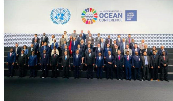
Heads of delegations at the United Nations Ocean Conference convened under the theme, "Scaling up ocean action based on science and innovation on the implementation of Goal 14: stocking, partnerships and solutions"

The President of the United Nations General Assembly provided the opening remarks at the conference and stated that "The Ocean connects all of us; it connects humanity; connects our planet. There is no context whereby we live on this planet without it."