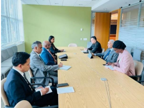
President of the General Assembly His Excellency Abdulla Shahid met with the Chair & members of the Special Committee to Investigate Israeli Practices Affecting the Human Rights of the Palestinian People & Other Arabs of the Occupied Territories.