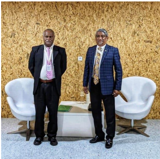
State Minister Ahmed Khaleel meets with the Minister of Climate Change of Vanuatu, Hon. Silas Bule Melve

On the margins of the United Nations Oceans Conference 2022 State Minister Ahmed Khaleel met with the Minister of Climate Change of Vanuatu, Hon. Silas Bule Melve and discussed enhancing the cooperation between the two countries on areas of shared concern and mutual interest.