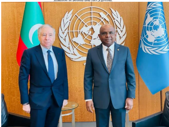
President of the General Assembly His Excellency Abdulla Shahid met with the United Nations Secretary General's Special Envoy for Road Safety Jean Todt. Agreed that the adoption of the political declaration on road safety is a victory for multilateralism.