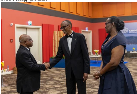
President of the General Assembly His Excellency Abdulla Shahid met with the President of Rwanda His Excellency Paul Kagame and the First Lady Mrs. Jeannette Kagame.

The President of the United Nations General Assembly His Excellency Abdulla Shahid commenced an official visit to Rwanda on 23 June 2022 ahead of the Commonwealth Heads of Government Meeting 2022.