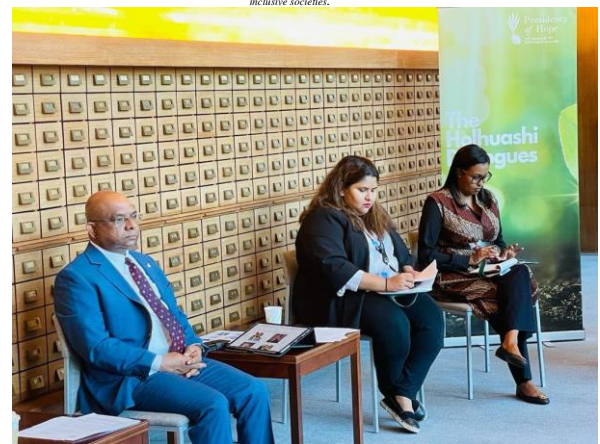
President of the General Assembly His Excellency Abdulla Shahid Hosted the 9th Holhuashi dialogue on the topic "Greening the Blue: How the United Nations system secures coherence between words and actions in fighting global warming."