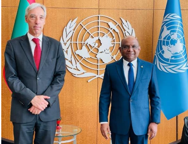
President of the General Assembly His Excellency Abdulla Shahid met with Portugal's Minister of Foreign Affairs His Excellency Mr. João Cravinho. Discussed Ukraine climate change and Youth.