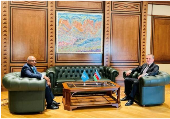
The President of the United Nations General Assembly His Excellency Abdulla Shahid meeting with Minister of Foreign Affairs of the Republic of Azerbaijan His Excellency Mr Jeyhun Bayramov.

Furthermore, the President of the UN General Assembly met with Her Excellency Ms. Sahiba Gafarova, Chairperson of Milli Majlis (Parliament). They had a thoughtful conversation on the role of parliamentarians in global multilateralism, and the critical importance of women at all levels of decision-making.