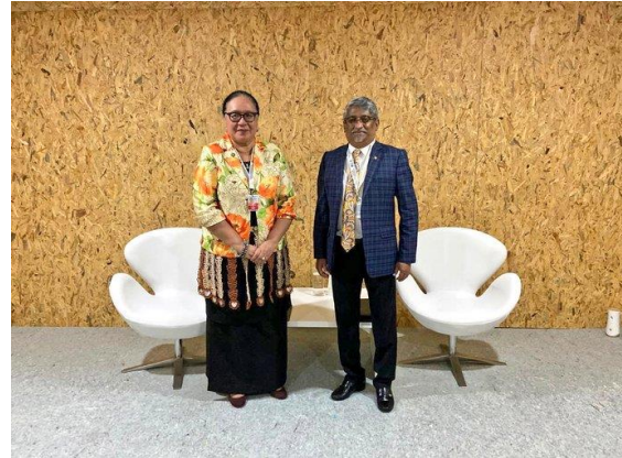
State Minister Ahmed Khaleel meets with Minister for Foreign Affairs and Minister for Tourism of Tonga, Hon. Fekitamoeloa 'Utoikamanu

Additionally, State Minister Ahmed Khaleel also met with the Minister for Foreign Affairs and Minister for Tourism of Tonga, Hon. Fekitamoeloa 'Utoikamanu and discussed enhancing the cooperation between the two countries on areas of shared concern and mutual interest.