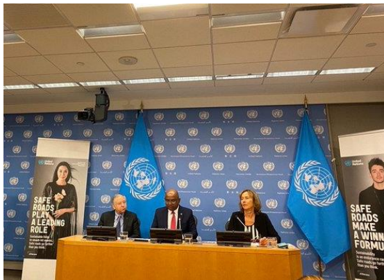
President of the General Assembly His Excellency Abdulla Shahid met with the United Nations Secretary General's Special Envoy for Road Safety Jean Todt. And the Executive Secretary for United Nations Economic Commission for Europe Olga Algayerova calling for more support for United Nations Road Safety Fund to help developing countries

During the remarks delivered by the President of the United Nations General Assembly during the high-level meeting, UNPGA stated that “Safe mobility systems offer the promise of a safer, healthier and better future for everyone, everywhere.”