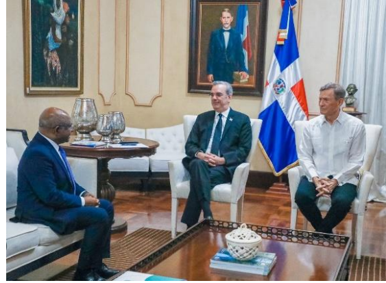
The President of the United Nations General Assembly His Excellency Abdulla Shahid called on President of Dominican Republic His Excellency Mr. Luis Abinader

During the visit the President of the UN General Assembly had called on the President of Dominican Republic His Excellency Mr. Luis Abinader and discussed issues such as post-Covid recovery efforts and challenges faced by SIDS.