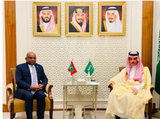
Foreign Minister His Excellency Abdulla Shahid meeting with the Foreign Minister of Saudi Arabia His Royal Highness Prince Faisal bin Farhan Al Saud

During this visit Foreign Minister Shahid met with the Minister of Foreign Affairs of the Kingdom of Saudi Arabia, His Royal Highness Prince Faisal bin Farhan Al Saud in Riyadh, Saudi Arabia and reflected on the long-standing fraternal bonds of friendship and cooperation between the Maldives and Saudi Arabia, based on Islamic solidarity, mutual understanding and goodwill.