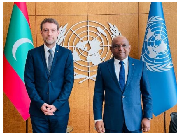
President of the General Assembly His Excellency Abdulla Shahid met with Permanent representative of Albania to United Nations and president of Security council for June His Excellency Ambassador Mr. Ferit Hoxha. Discussed Protection of Human Rights and International Law.