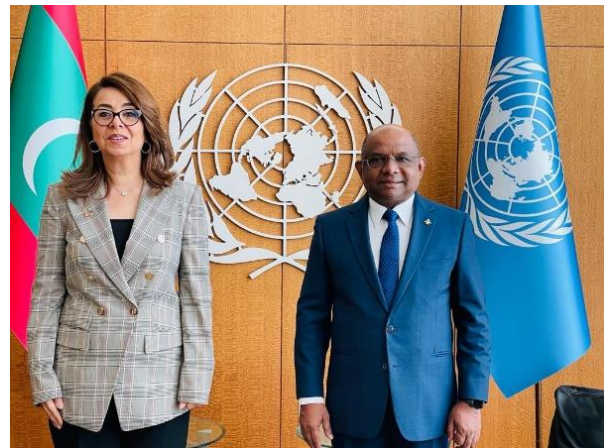
President of the General Assembly His Excellency Abdulla Shahid met with the Executive Director of the United Nations Office on Drugs and Crime and Director-General of the United Nations Office at Vienna Ms Ghada Fathy Waly. Discussed the need to involve youth in implementation of the Our Common Agenda proposals.

President of the General Assembly's regular meetings with Heads of Government, Foreign Ministers, the Permanent Representatives, and Heads of International Organisations continued in June 2022.