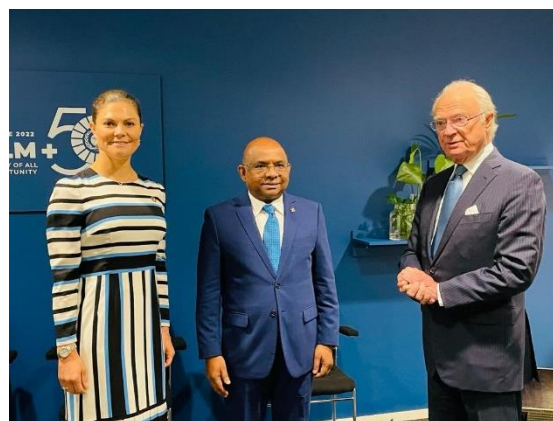
The President of the United Nations General Assembly His Excellency Abdulla Shahid meeting His Majesty King Carl XVI Gustaf & Her Royal Highness Crown Princess Victoria. Commended the Swedish leadership on environment conservation and climate action

During the opening segment of the event the President of the United Nations General Assembly stated that “Human progress cannot occur on an earth that is starved of its resources, marred by pollution and is under relentless assault from a climate crisis of our own making”