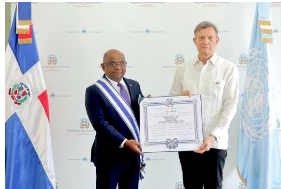
Foreign Minister Abdulla Shahid with Foreign Minister of the Dominican Republic His Excellency Mr Roberto Álvarez.

the Dominican Republic by the Foreign Minister of the Dominican Republic His Excellency Mr Roberto Álvarez.