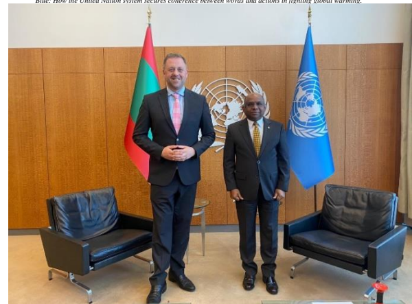
President of the General Assembly His Excellency Abdulla Shahid met with Minister of State for European Affairs of Ireland His Excellency Mr. Thomas Byrne. Discussed the High-Level Meeting on road safety, youth and the importance of multilateralism.