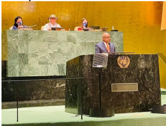
President of the General Assembly Abdulla Shahid presided over General Assembly meeting which adopted the resolution on Veto Initiative

On 26 April 2022 the President of the UN General Assembly, Abdulla Shahid Presided over the General Assembly meeting that took action on Liechtenstein's Veto Initiative draft resolution which mandates a meeting of the General Assembly whenever a veto is cast in the Security Council.