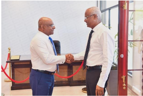
Foreign Minister Abdulla Shahid welcomed President Ibrahim Mohamed Solih to the Ministry of Foreign Affairs to inaugurate the Honorary Consuls Scholarship Programme.

President Ibrahim Mohamed Solih inaugurated the Honorary Consuls Scholarship Programme on 19 April 2022. Under this landmark programme a total of 44 Scholarships from 7 Honorary Consuls will be offered in various fields and in line with the Presidential pledge to raise academic capacity, training and skills development. It includes opportunities to study in India, Thailand, Pakistan, Türkiye, Lebanon and Germany.