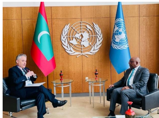
President of the UN General Assembly His Excellency Abdulla Shahid met with the Permanent Representative of Italy to the United Nations, His Excellency Ambassador Maurizio Massari. Discussed a range of issues including Our Common Agenda and its implementation as well as Intergovernmental Negotiations on Security Council reforms.