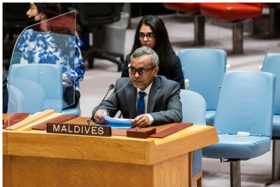
Deputy Permanent Representative of the Republic of Maldives to the United Nations Ibrahim Zuhree delivered the statement during the United Nations Security Council Open Debate on the Situation in the Middle East held on 27 April 2022

At United Nations Security Council Open Debate on the Situation in the Middle East, held in New York on 27 April, Maldives expressed deep concerns over the recent escalations of religious tensions in the Al-Aqsa Mosque site and called for immediate de-escalation and maintenance of the historical status quo in the Old City of Jerusalem.