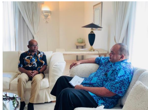
President of the UN General Assembly His Excellency Abdulla Shahid met with Tonga's Prime Minister Hu'akavameiliku Siaosi Sovaleni during his visit to Palau. Discussed the recent volcanic eruption and tsunami in the South Pacific that caused extensive damage in Tonga