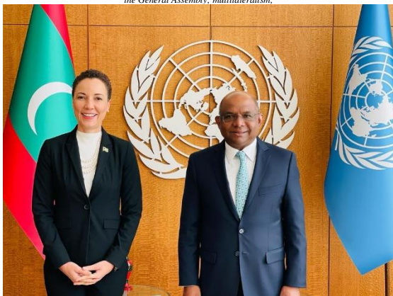
President of the UN General Assembly His Excellency Abdulla Shahid met with the Minister of Foreign Affairs and Foreign Trade of Jamaica, Honourable Kamina J. Smith discussed AIDS issues & perspectives that AIDS can bring to multilateralism, Gender, HOPE Fellowship & other initiatives