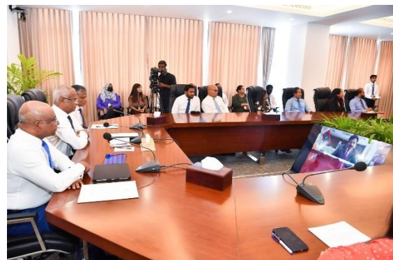
Honorary Consul joined the Inauguration Ceremony Virtually

Foreign Minister Shahid thanked all the Honorary Consuls who joined the initiative and highlighted that these Scholarships will open new avenues for Maldivian youth to advance their education and gain experience through training opportunities. Minister Shahid also thanked Honorary Consuls for their active support in the socio-economic development of Maldives and expressed hope for more participation for the Programme in years to come.