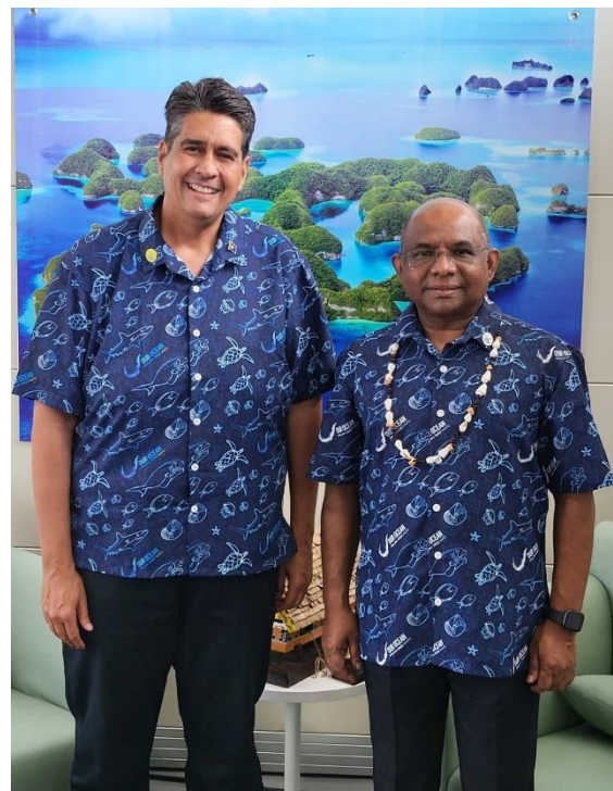
President of the UN General Assembly His Excellency Abdulla Shahid called on the President of Palau His Excellency Surangel Whipps, Jr. and congratulated on hosting a very successful Our Ocean Conference

Microplastics and Marine Pollution – President of the UN General Assembly emphasized tackling plastic pollution.