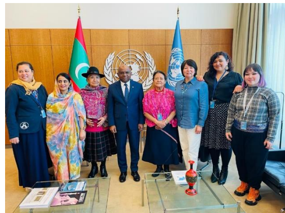
President of the UN General Assembly His Excellency Abdulla Shahid met with a group of Indigenous Women who continue to face challenges to the full enjoyment of their human rights.