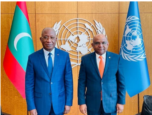
President of the UN General Assembly His Excellency Abdulla Shahid met with the Permanent Representative of Côte d'Ivoire to the United Nations His Excellency Ambassador Kacou Houadja Léon Adom. Discussed preparations for the 15th session of the Conference of the Parties of the The United Nations Convention to Combat Desertification.