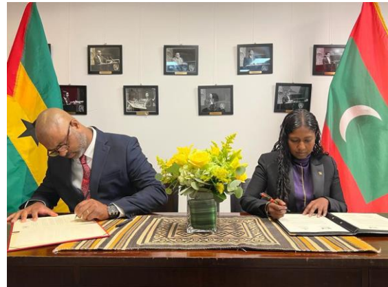
Permanent Representative of Maldives to the United Nations and Chargé d'Affaires a.i./Deputy Permanent Representative of the Democratic Republic of Sao Tome and Principe to the United Nations signed the Joint Communiqué formalising diplomatic relations

to the United Nations and on behalf of the Government of São Tomé and Príncipe by Mr. Alcínio Cravid e Silva, Chargé d'Affaires a.i./Deputy Permanent Representative of the Democratic Republic of Sao Tome and Principe to the United Nations.