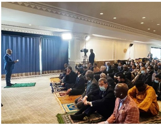
President of the General Assembly delivers sermon at the Friday Prayer held at the United Nations

On 30 April 2022 the President of the General Assembly His Excellency Abdulla Shahid delivered the sermon and lead Friday prayers today at the United Nations.