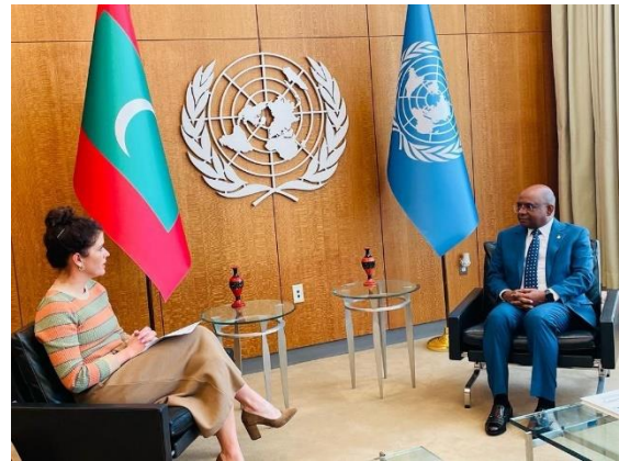
President of the General Assembly His Excellency Abdulla Shahid met the Minister of Foreign Affairs of Iceland Her Excellency Ms. Thórdís Kolbrún Reykjaförð Gylfadóttir, discussed the situation in Ukraine, the role played by the GA, the impact of the war and inevitability of the multilateral system and role of the UN in returning to dialogue and peace.

Permanent Representatives, and Heads of International Organisations continued in April.