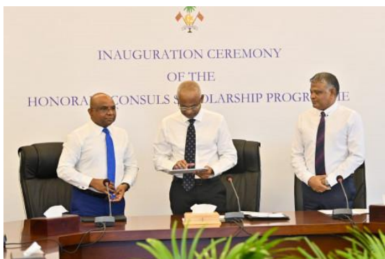
President His Excellency Ibrahim Mohamed Solih inaugurates the Honorary Consuls Scholarship Programme

At the inauguration ceremony held at Ministry of Foreign Affairs, President Solih in his remarks noted this new initiative will give renewed momentum in the ambitious development agenda of the Government of Maldives to pave way for Maldivian youth to pursue Higher Education across the globe.