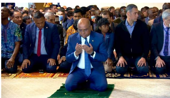
The President of the General Assembly His Excellency Abdulla Shahid leading Friday prayers on 30 April 2022 at the United Nations.

In the sermon the President of the General Assembly highlighted the message to have respect for our common humanity and each other, the importance of mercy and compassion, learning from the life and actions of Prophet Mohamed (SAW).