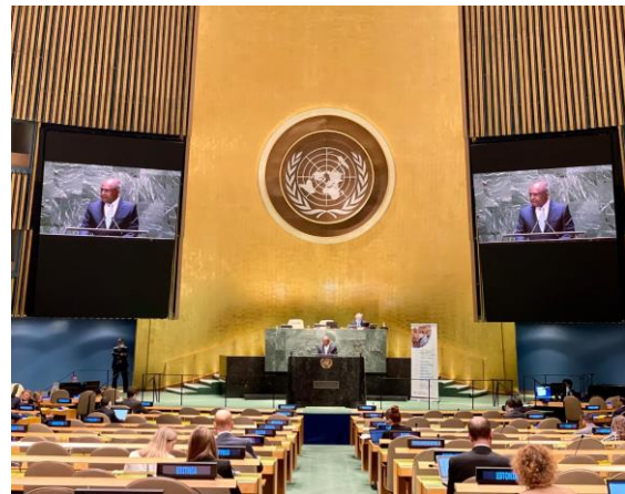
President of the General Assembly delivering his remarks at the High Level meeting on Peacebuilding financing where he stated that the root causes of conflicts and crises – exclusion, inequality, discrimination, poverty and violations of human rights – need to be comprehensively addressed if we are to maintain any semblance of peace and security, or to sustain long-term development efforts.

President of the General Assembly His Excellency Abdulla Shahid delivered his opening remarks for a High-Level meeting on Peace Building Financing held on 27 April 2022.