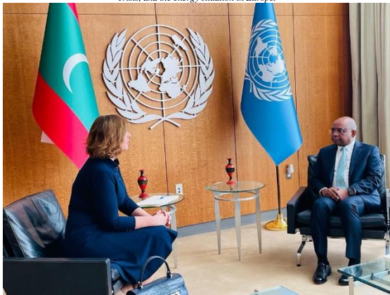
President of the UN General Assembly His Excellency Abdulla Shahid met with Slovakia's Deputy Prime Minister & Minister for Investments, Regional Development & Informatization, Her Excellency Ms. Veronika Remi  ov  , and discussed the ongoing conflict in Ukraine; the role of the UN, particularly the General Assembly; multilateralism;