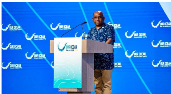
President of the General Assembly addressing the Our Ocean Conference in Palau urged the international community to expand protected areas of the ocean, support the scientific community and tackle plastic pollution.

President of the UN General Assembly addressed the Conference, which this year is focusing on the theme, "Our Ocean, Our People, Our Prosperity." This is the first year that the Conference is being hosted by a Small Island Developing State.